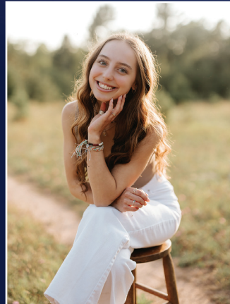
Ella Pearson Drummond High School