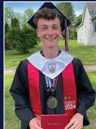
Jackson Ray Washburn High School