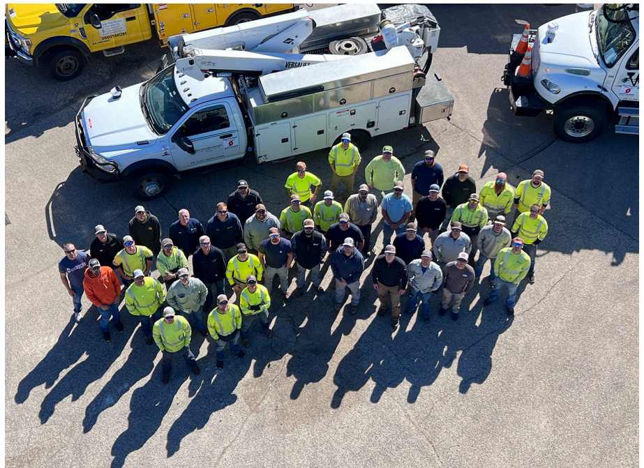
Forty-five Wisconsin linemen took part in the hurricane relief effort.

Bayfield Electric sent two linemen and a truck to assist. They joined a convoy of linemen and trucks from 14 other Wisconsin co-ops and started the journey to South Carolina. Crews faced challenges with working conditions, widespread damage and changing weather. The crews worked in teams for 16-hour days and slept on cots in tents. Their hard work and efforts brought relief and joy to local residents once they saw their homes and businesses energized once again.