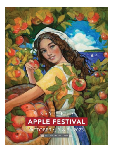
The 61st annual Apple Festival poster was created by Tonja Sell of (Do)ARTWORX in Oulu.

Bayfield Lakeside Pavilion. The festival culminates with the Grand Parade marching down historic Rittenhouse Avenue, to Lake Superior.